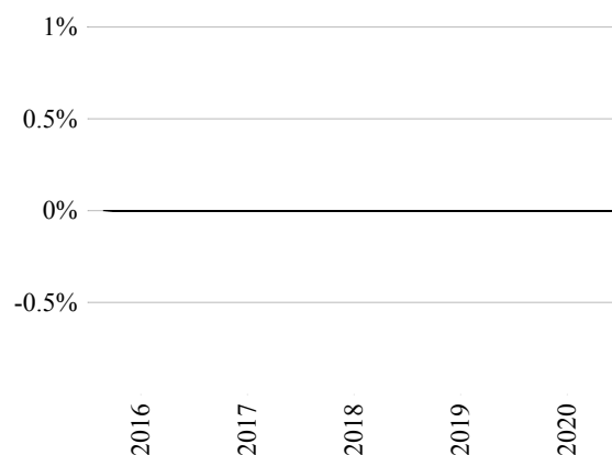
Global Short Maturity Sustainable High Yield Fund - Class C Capitalization EUR hedged

The share class performance (return) is calculated after deduction of ongoing charges. The possible entry and exit charges have not been taken into account.