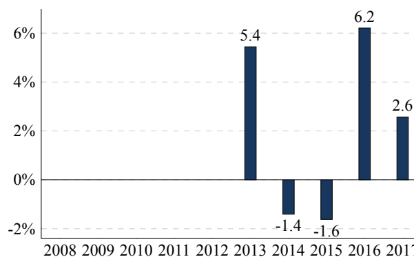
SKY Harbor Global Funds - U.S. Short Duration High Yield Fund F Capitalization GBP (LU0765419733)

The share class performance (return) is calculated after deduction of ongoing charges. The possible entry and exit charges have not been taken into account.