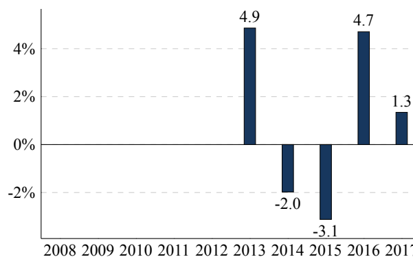
SKY Harbor Global Funds - U.S. Short Duration High Yield Fund F Capitalization CHF (LU0765419907)

The share class performance (return) is calculated after deduction of ongoing charges. The possible entry and exit charges have not been taken into account.