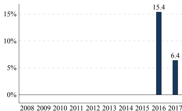
SKY Harbor Global Funds - U.S. High Yield Fund F Capitalization USD (LU0765424147)

The share class performance (return) is calculated after deduction of ongoing charges. The possible entry and exit charges have not been taken into account.