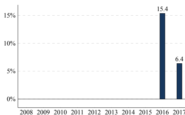
SKY Harbor Global Funds - U.S. High Yield Fund F Capitalization USD (LU0765424147)

The share class performance (return) is calculated after deduction of ongoing charges. The possible entry and exit charges have not been taken into account.